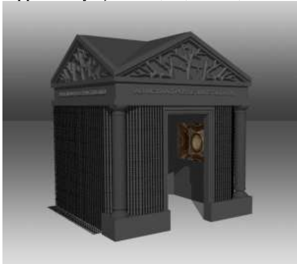
Breathless Beauty - Broken Beauty sculpture © VanessaJane Hall

Supported by AJA Video, LG, Medite, Unistrut, Wentra.